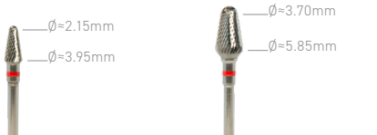
BTBUDF40 Fine Cut Small Bud