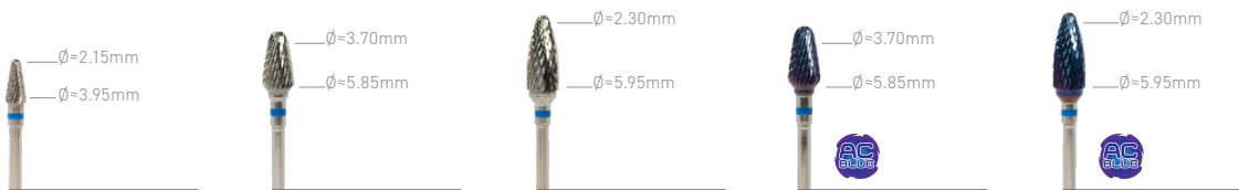
BTBUDM40 Medium Cut Small Bud