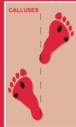
FOOT PROGRESSION ANGLE