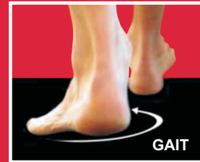
MEDIAL HEEL PIVOT

The Quad E foot-type is one of the most unique looking feet, often with a reverse-lasted foot shape. This foot-type is the result of a combined Uncompensated Rearfoot Varus, coupled with a large Rigid Forefoot Varus.