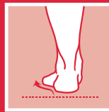
ABDUCTED TOE SIGN