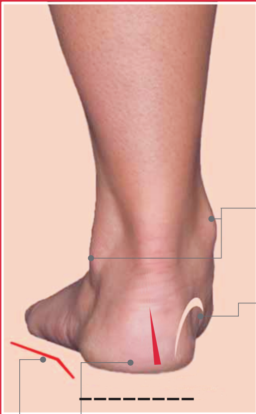
MILDLY INVERTED HEEL ALIGNMENT ABDUCTED FOREFOOT